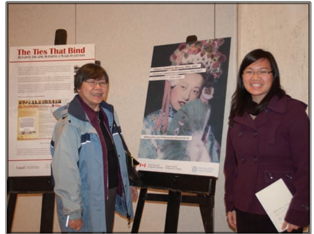
Launch of Chinese Canadian Women, 1923-1967 website and The Ties That Bind video documentary

The MHSO also worked closely with the Foundation to Commemorate the Chinese Railroad Workers in Canada (FCCRWC) to produce and documentary video, The Ties That Bind . This project celebrates Chinese Canadian railway workers and their contributions to our nation. Watch the documentary video to hear Chinese Canadians speak about their ancestors' experiences building the CPR.